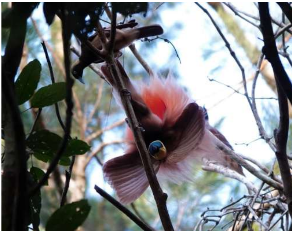
We have a good chance of seeing the extravagant display of the famous Raggiana Bird-of-Paradise

NOTE: Papua New Guinea is very special and one of the most exciting places on earth. However, the internal airline schedules change frequently. This itinerary is subject to change, dependent on the existing internal air schedules, which may affect the order of the day-to-day activities. Please be assured that the focus of the tour will stay the same and you will still visit all of the same areas. It is also important to realize that security can be an issue and participants are recommended to not go birding on their own and follow the instructions of the leader.