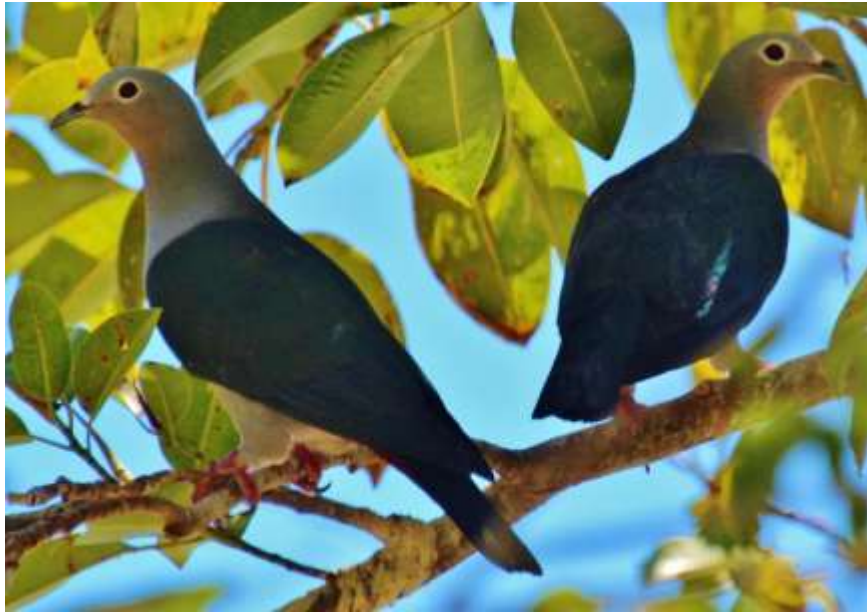
A pair of Island Imperial-Pigeons - set against a turquoise blue ocean in New Britain.

New Britain is the largest of the Melanesian islands in the Bismarck Archipelago. It has a unique bird fauna, reflecting the fact that it has never been in contact with mainland New Guinea, allowing colonizing species to evolve in isolation. It is a superb coral fringed, forest-covered island dominated by volcanoes, some of which are active. The forests support an amazing biomass of birds, many spectacular, raucous and conspicuous. It will be impossible to miss such species as the Brahminy Kite, Blue-eyed Cockatoo, Eclectus Parrot, Blyth's Hornbill and Purple-bellied Lory.