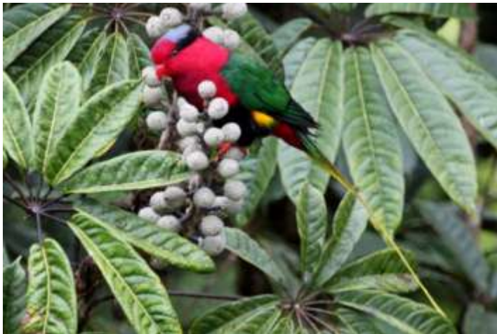
This amazing Papuan (Stella's) Lorikeet was photographed at Kumul Lodge.

Also present are the elusive Bronze Ground-Dove, two species of rather retiring tiger-parrots—Brehm's and the uncommon Painted; five species of lorikeet (Papuan, Plum-faced, Orange-billed, Yellow-billed and in the lower valley sometimes Goldie's); Rufous-throated Bronze-Cuckoo; Archbold's Nightjar (scarce); Mountain Swiftlet; Long-tailed Shrike; Pied Bushchat; Island Thrush; Blue-capped Ifrit; Regent, Brown-backed and Black-headed whistlers; Rufous-naped Bellbird; Island Leaf-Warbler; Mountain Mouse-Warbler; Papuan and Large scrubwrens; Brown-breasted Gerygone; Dimorphic and Black fantails; the very handsome Black-breasted Boatbill; Papuan Flycatcher; Black Pitohui; the peculiar-