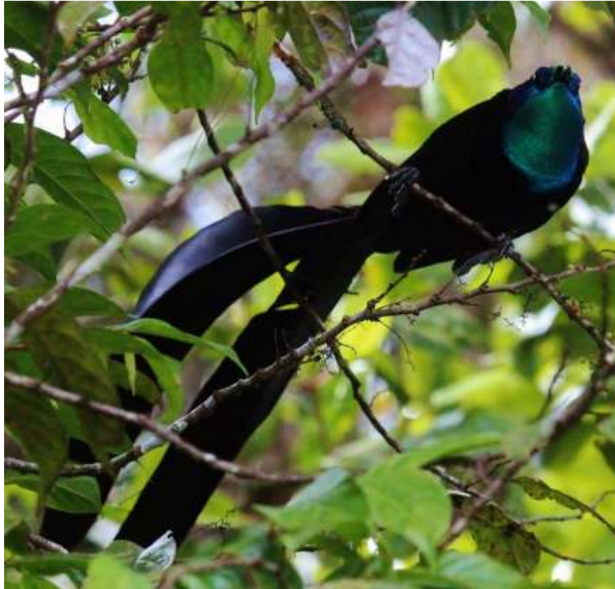
Stephanie's Astrapia is a prized sighting at Ambua Lodge.