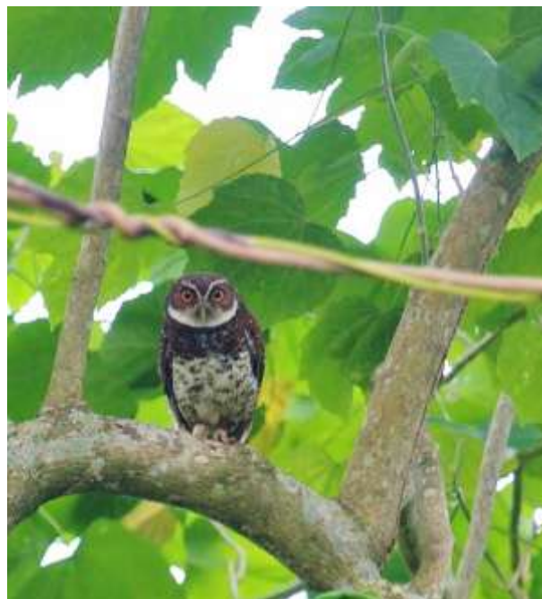
The delightful New Britain Boobook is always a chance in the forest near the resort.

During our time on New Britain, we will concentrate our attentions upon the magnificent, tall lowland and hill forests of the island's north coastal plain. All the lowland and foothill species recorded from New Britain, including a number of very special endemics, can be found in the forests of the nearby Garu Wildlife Management Area. Much of our time will be spent birding here along forested roads and tracks. However, as the day warms up, we will enter the forest along narrower, shady trails to look for some of the island's more secretive species. Birds we may encounter include Melanesian Scrubfowl; Black Honey-buzzard (rare); Variable Goshawk; Oriental Hobby; New Britain Rail (secretive deep forest inhabitant); Knob-billed, White-breasted, and Superb fruit-doves; Red-knobbed, Finsch's, Yellowish and Bismarck imperial-pigeons; Amboyna and Pied cuckoo-doves; Stephan's Dove; New Britain