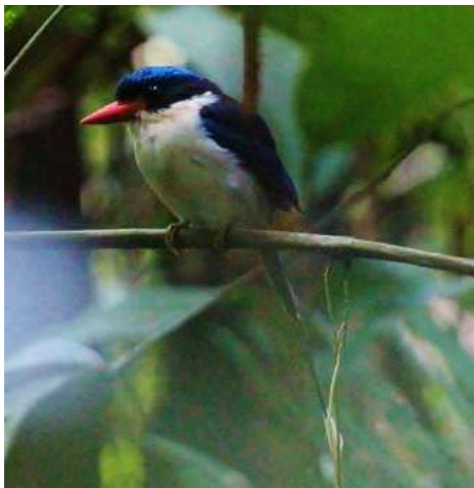
Papua New Guinea harbors the greatest diversity of kingfishers in the world and some of the most special like this Little Paradise-Kingfisher.

July 17, Day 6: Fly River. We have visited the lowland forests of the Kiunga area almost every year since 1986. Each year, new and exciting, little-known species have been added to the list of species for this area. There is a chance for the poorly known Little Paradise-Kingfisher, enigmatic Forest Bittern or perhaps we will find that most elusive of species, the Campbell's Fairywren.