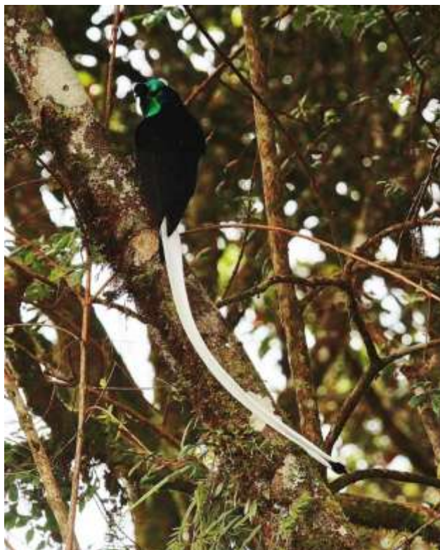
A male Ribbon-tailed Astrapia glows in the dark forest at Kumul Lodge.

can visit the display site of the Lesser Bird-of-Paradise. There is a good chance to see the intensely colored orange male Crested Satinbird feeding quietly in a fruiting tree. This is a good place to encounter this scarce and inconspicuous species. Kumul has recently become the best place to see the extraordinary Brown Sicklebill and the gorgeous Ribbon-tailed Astrapia. At night it is possible to search for Mountain Owlet-Nightjar and Papuan Boobook. Over the years we have also sighted a few mammals including Speckled Dasyure, Black-tailed Antechinus, Raffray's Bandicoot, Calaby's Pademelon, Black-tailed Giant-Rat, Pygmy and Masked ringtails plus Silky Cuscus. Kumul Lodge is great for photography.