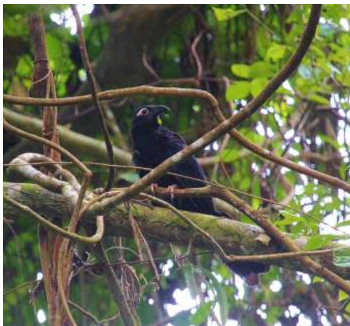
The forest reverberates to the deep booming of the Violaceous Coucal but catching a view requires patience.

Bronzewing (rare); Purple-bellied Lory (a spectacular parrot, the strange donkey-like braying call is often the first indication of its presence); Red-flanked Lorikeet; Buff-faced Pygmy-Parrot; Blue-eyed Cockatoo (a raucous endemic); Eclectus and Singing parrots; Green-fronted Hanging Parrot (rare); Channel-billed Cuckoo; the weird, endemic Violaceous and Pied coucals; New Britain Boobook; perhaps if we are very lucky, the gorgeous Golden Masked-Owl; White-rumped Swiftlet; Common, New Britain Dwarf-, New Britain, Sacred and Melanesian kingfishers; Black-capped Paradise-Kingfisher; Dollarbird and Rainbow Bee-eater; Blyth's Hornbill; Pacific Swallow; New Britain Pitta (a great skulker like all members of its family); Common Cicadabird and White-bellied Cuckooshrike; Northern Fantail and Willie Wagtail; Spangled Drongo; Black-tailed Monarch; Dull and Shining flycatchers; Red-banded Flowerpecker; Black and Olive-backed sunbird; New Britain Friarbird; Ashy Myzomela; the gorgeous Black-bellied Myzomela; Long-tailed Myna; Metallic and Singing starling; Bismarck Crow; and the localized Bismarck Munia.