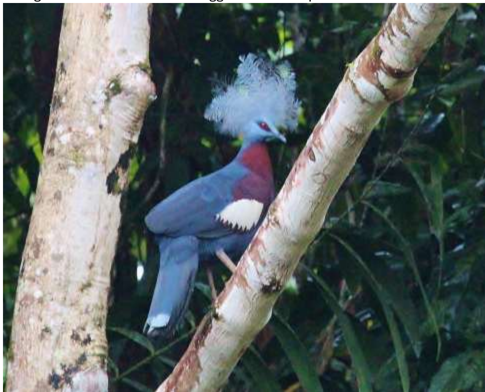
The amazing Sclater's Crowned Pigeon is a chance along the rivers near Kiunga.

Then there are the birds-of-paradise. Glossy-mantled and Trumpet manucodes are both common, but can take some work to see well. We should also be able to show you the dawn display sequence of the Twelve-wired Bird-of-paradise. King Bird-of-paradise is an unbelievable gem—the intensity of its calls and its red color have to be witnessed to be believed and again we should be able to view one at its display tree. We will also hear and with some luck see the distinctive sounding Magnificent Riflebird and witness a display tree full of cavorting adult male Greater and Raggiana birds-of-paradise.