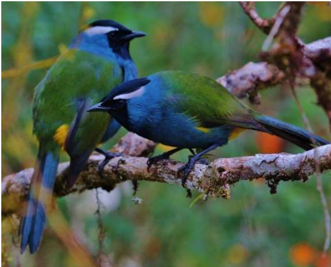
The superb Crested Berrypecker shows well at Kumul Lodge; representative of a New Guinea endemic bird family, the Painted Berrypeckers.